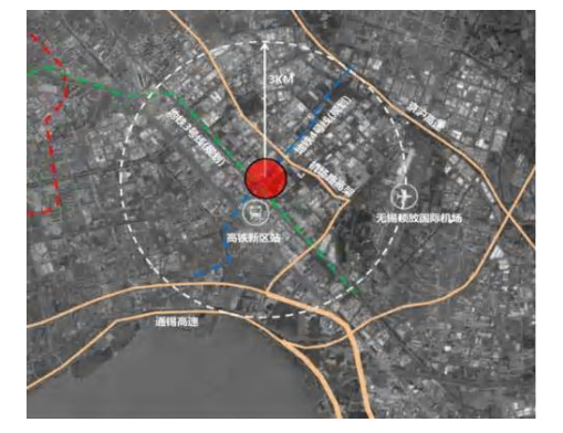
Figure 1 Base region map.

The Baolong 2BC plot studied in this study is located in Xinwu District, Wuxi City, Jiangsu Province. The plot is developed into a large-scale commercial complex. The plot is adjacent to Lijiang Road in the east, the Pearl River Road in the west, facing the railway station in Xinwu District, Wuxi, Haichuang Fourth Road in the south, and Xinhua Road in the north. As shown in Figure 1. Wuxi Xinwu Station will have the intersection of Wuxi Metro Line 3 and Line 4 in the future, making it a large-scale transportation hub.