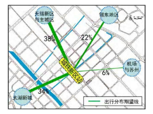
Figure 3 Proportional diagram of travel in all directions at the urban railway station.

The transportation around the plot is convenient, and the comprehensive transportation mode is relatively mature. The proportion of travel in all directions at the urban railway station is shown in Figure 3.