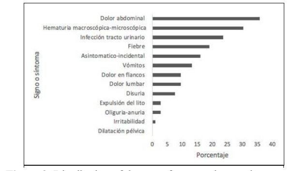
Figure 2. Distribution of the most frequent signs and symptoms in patients with a diagnosis of renal lithiasis seen at the National Children's Hospital. 2000–2018

In 27.9% (n=26) of the patients, data of infection were detected in the urine examination and an alkaline urinary pH was found in 65% (n=60).