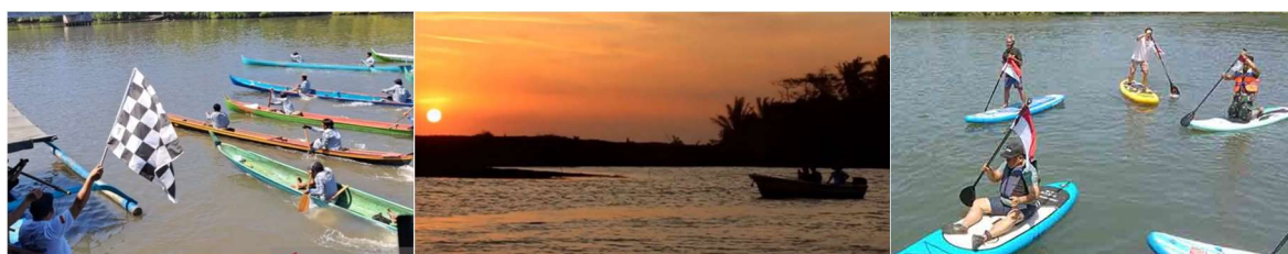
Figure 6. Marine tourism attractions and views of Perancak Beach.

menu of sea and freshwater fish as well as processed foods typical of the port coastal area.