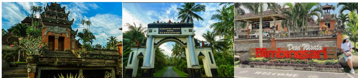
Figure 8. The church with Balinese architecture, the main gate, and the brand of Blimbingsari.

Being the pioneers in offering religious tourism services, an increasing number of individuals are establishing comprehensive enterprises in the form of homestays and other service hubs, including mini-markets, cafes, restaurants, and tour guide services. Additionally, numerous cohorts of international students embarked on spiritual expeditions while camping in this village. Local communities greatly benefit from small businesses that encompass all sectors of society. The economy is experiencing growth, with a concurrent rise in per capita income. Additionally, the activities of this tourist village are positively influencing the quality of education and health.