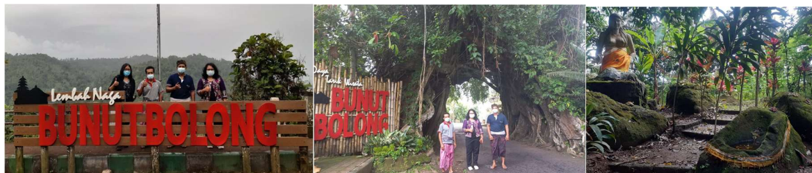
Figure 2. Dragon Valey, Bunut hole tree, Sarcopagus.

The tourist village offers a range of attractions, activities, and community-based businesses for visitors to enjoy. These include taking selfies at Bunut Bolong (as seen on Figure 2 ), exploring the archaeological sites of Batu Palungan and Sarcopagus, witnessing the twin waterfalls, embarking on forest tracking and Naga Valley exploration, savoring coffee amidst the misty ambiance of Dragon Valley, visiting a cattle farm, learning Balinese dance and gamelan, and indulging in traditional Balinese cuisine.