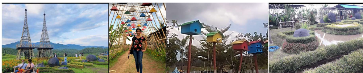
Figure 4. Munduk Nangka garden, spot selfie, pigeon breeding, and fishing pond.

traditional snacks. Additionally, there is a location designated for healing, which attracts numerous individuals seeking both physical and spiritual purification. These places of interest can be seen in Figure 4 . Tourists visiting this village prioritize the invitation to experience the village's lifestyle, which includes access to nutritious organic food and affordable traditional culinary options. In addition, the community also possesses the customary art form of JEGOG, specifically a bamboo gamelan ensemble, which is consistently showcased during performances in Jembrana Regency.