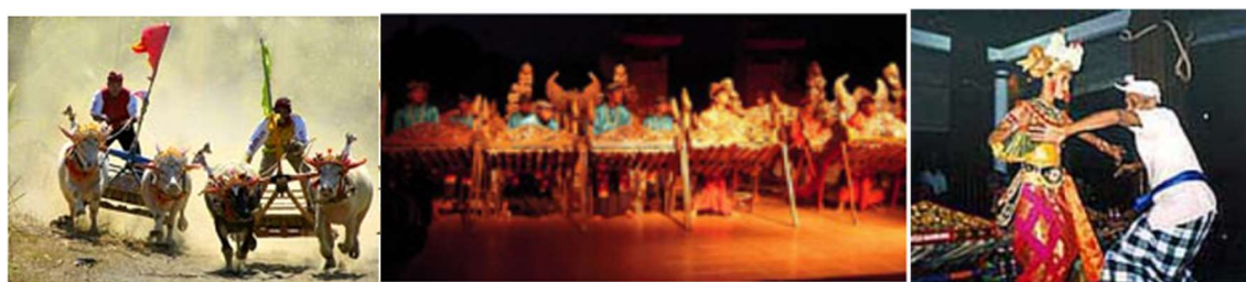
Figure 7. Makepung tradition, jegog and joged bungbung performance.

This village is in close proximity to the coastal region. An interview conducted in 2022 with Mr. Nano highlights the exceptional potential of this village, characterized by a wide range of professions among its residents. These include fishermen, buffalo breeders, producers of organic fertilizer, micro, small, and medium enterprises (MSMEs) engaged in fish product manufacturing, and those involved in the processing of lobsters. Some of these activities can be seen in Figure 7 . This village is renowned for its artistic contributions, particularly in the fields of rindik and joged. By structuring it as a comprehensive tour package, visitors to this village will be thoroughly pleased with the array of activities and attractions available to them. The activities include dance lessons, rindik performances, spectating cow races on the beach, fishing excursions, visits to buffalo farms, and concluding with culinary tours featuring traditional menus consisting of fish, chicken, and various meats. This tourist village is made instagrammable by its camping grounds, which feature swings and appealing coral selfie spots. The existence of diverse associations, such as sekehe rindik, mancagra associations, jogging clubs, dance studios, and other artistic organizations, significantly enhances the appeal of this village for tourists.