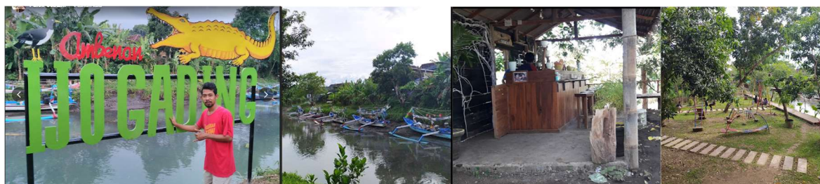
Figure 5. Spot selfie, boat dock, coffee house, and outdoor garden of Ambenan Ijo Gading.

Ambenan Ijo Gading Village (as seen in Figure 5 ) exhibits a robust presence of Islamic culture. Mr. Muchtar, the spokesperson for the chairman of the village tourism management group, elucidates that this village possesses the distinctive attribute of being a producer of Loloan woven cloth. A significant number of individuals in Ampenan village demonstrate creativity in various activities such as pigeon breeding, hydroponic vegetable cultivation, and the preparation of traditional dishes like satay and pigeon peleceng. The village's culture of residing on stilts, which is distinguished by local artistic dances, frequently entails hosting community-oriented artistic gatherings that attract tourists from diverse backgrounds. If this village consolidates tourist attractions and activities that are rooted in indigenous knowledge, featuring the distinctive Loloan weaving, Loloan boat rides, and the highly sought-after pigeon cuisine, then the sustainability of this tourist village is assured.