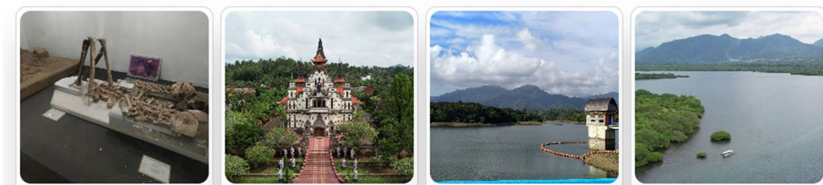
Figure 3. Gilimanuk Museum, Ekasari Church, Palasari Dam and Gilimanuk Bay.

Anom, the manager of this tourist village, stated that the village is situated in close proximity to the dam and boasts expansive brown fields. These varying circumstances result in disparities when it comes to determining the activities and attractions provided to tourists. The tourist village offers a range of activities, such as renting boats at Palasari Dam, visiting selfie spots at Palarejo Village, taking religious tours to the church and Maria Cave, exploring cocoa plantations, learning to dance, and savoring traditional Balinese culinary delights, including satay and suckling pig. Figure 3 shows a couple of these places of interest, such as the museum, church, dam, and bay.