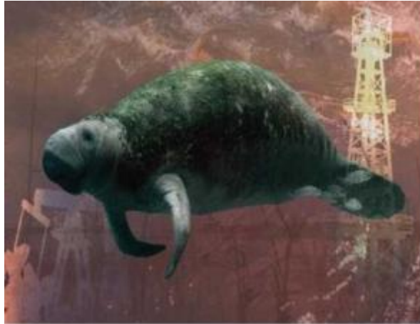
Fig. 4. Manatee ( Trichechus manatus ).