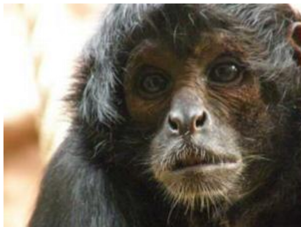
Fig. 3. Brown spider monkey "teles hybridus).

Additionally, species unique to the region such as the brown spider monkey ( Ateles hybridus ) [52] and the manatee ( Trichechus manatus ) [53], both in danger of extinction, are being affected.