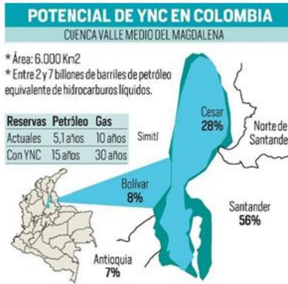
Fig. 2. Unconventional reservoir potential in the Middle Magdalena Valley Basin in Colombia.

The Barrancabermeja oil zone is home to a rich aquifer system with several marshes (El Llanito, Miramar, San Silvestre, Juan Esteban), making it a habitat of great biodiversity of birds, mammals, and fish. But due to the confluence of anthropogenic activities - the petrochemical industry, agribusiness, tourism, hunting and fishing - and the presence of a sanitary landfill and the illegal dumping of hydrocarbon residues that put pressure on the San Silvestre swamp, several species "including iguanas, turtles, otters, babillas, and caimans" are greatly diminished.