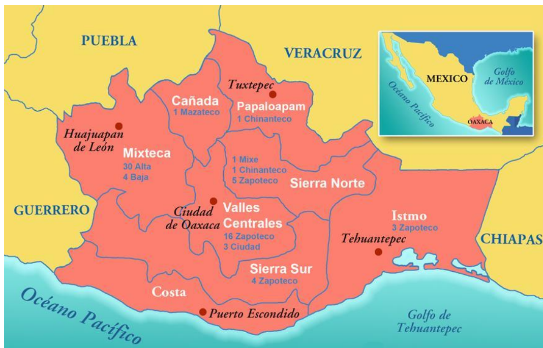
Figure 1. Regions into which the state of Oaxaca is divided. Extracted from Animal Gourmet

The Mixteca is located in a west-east direction, from the border between Guerrero and Oaxaca to the Valley of Oaxaca and, in a north-south direction, from the south of Puebla to the Pacific Ocean (17) . The Mixtec region is subdivided into three: Mixteca Alta, Mixteca Baja and Mixteca de la Costa, its administrative political division comprises 7 districts made up of 155 municipalities and 2,098 localities are registered, covering an area of approximately 40,000 square kilometers which occupy a third of the Oaxacan territory, at the confluence of the Sierra Madre del Sur and the Sierra de Oaxaca, see Figure 1 and Figure 2 (18,19,20) . The Oaxacan Mixteca is the most depressed region in the province of Oaxaca, as it has social and ecological limitations that restrict its economic development. (21)