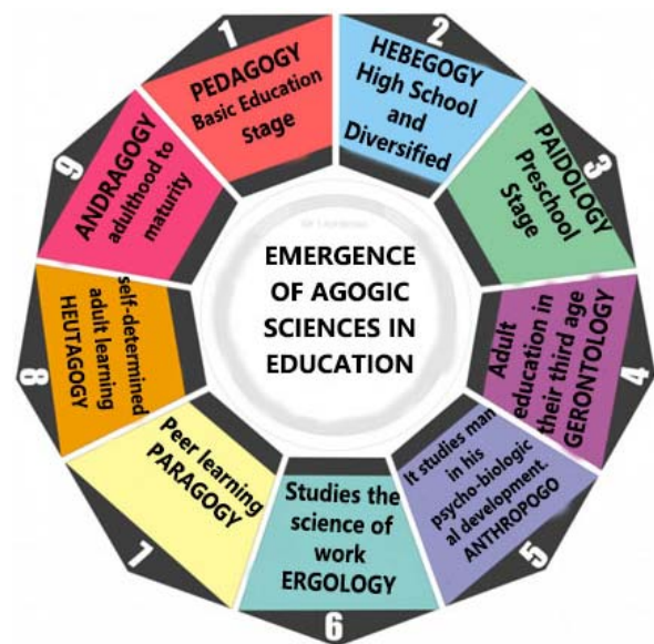
Figure 1. Emergency agricultural science in education [5] .

In this regard, it is worth noting that the learning cycle of education in the 21st century does not go beyond traditional pedagogy, but from the perspective of knowledge (pedagogy, hebegogia and andragogia, paidology, gerontology, anthropology, ergonomics, paragogia and heutagogy) (Figure 1). In other words, the teaching process in the digital age does not take advantage of technology, social networks and the skill potential to maximize the leading role of students as an option to think about the expression process of explaining the difficulties of human life.