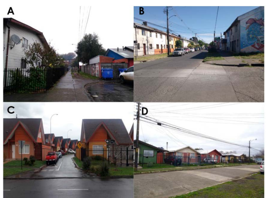
Figure 2. Photos of the study area. A. Abraham Lincoln, B. Tukapel, C. Las Encinas, D. La Portada.

Visited these communities to learn about the application of indicators ( Figure 2 ).