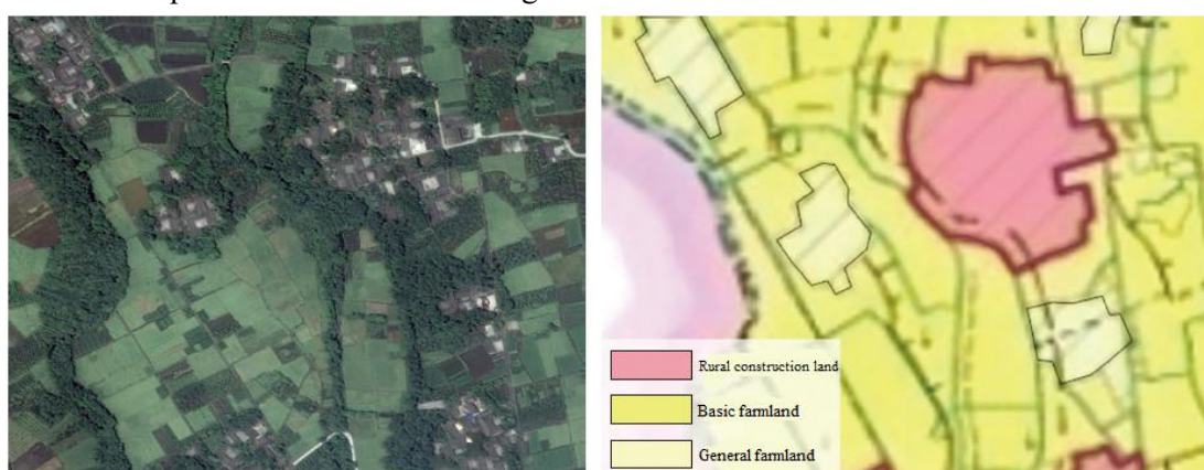
Figure 2. It is difficult for land use planning to effectively identify small pieces of secondary woodland

habitats are generally small in scale, scattered in layout, and numerous associated elements, so it is difficult to effectively identify and draw protection in the planning and control of land use ( Figure 2 ). Moreover, there is multi-department management, and the control measures of each department have a single factor protection orientation and are independent, which can not maintain the habitat composite function output well. (3) Lack of supporting technology: Limited by the accuracy of satellite remote sensing data, small patches of habitat are difficult to identify.