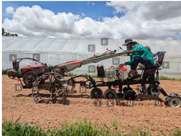
Figure 1. Side view of the transplanter photographed during the experiment.

The transplanter could plant one row at a time, and it was developed by modifying a prototype [23] provided by the National Soil Dynamics Laboratory (NSDL) of the United States Department of Agriculture (USDA) in the United States of America (USA). This fabrication was made possible under an open systems agricultural machinery manufacturing (OSAMM). The original prototype was designed to be attachable to a two-wheel tractor, but the operator had to walk behind. Then, improvements included adding a rear seat for the operator, a hydraulic control pedal, and two rear-seat wheels; adjusting the height and width of the transplanter; and installing a hydraulic pump to a two-wheel tractor to regulate the transplanter’s height and planting depth ( Figure 1; Table 1 ). Other parts were made the same, and they included a 24-V DC motor, used to roll a four-pod metal bar back and forth to allow the operator to feed seedlings; a transplanting tube used to convey the seedlings to the ground; a front cutting disk used for cutting residue; two furrow-opening disks; and two depth-adjusting wheels.