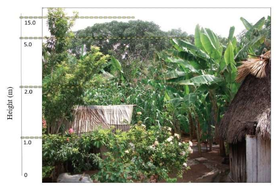
Figure 1. Strata of a home garden in the community of X-Maben, Quintana Roo.

The data collected on the production components, the various strata, and plant diversity in the home gardens showed two key results. First, it was observed that there are an average of 4–5 strata in each of the sites visited, as shown in Figure 1 , where in the lower stratum 0–1 m there is the greatest presence of ornamental, aromatic, vegetable, and medicinal species, which in most cases are located near the sides of the house; in the second 1–2 m stratum there is the presence of mostly grasses (corn) and various species of fruit trees in growth; in the third stratum of 2–5 m there is the presence of species such as banana, palms, and fruit species, among others; and the stratum greater than 5 m is composed of mature species of fruit trees, palms, and timber, and a diversity of herbaceous, shrub, and woody plants ( Table 1 ). Second, more than 95% of the households studied have both domestic and wild animals. Together, these components of both plant and animal production serve a variety of purposes, including the provision of food, fodder, medicines, and many others ( Table 2 ).