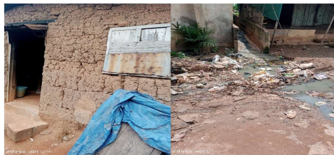
Figure 4. Building and road condition in Ugbo-owa.

From the observations made by the researchers, informal settlements in Enugu are besieged with most of the environmental challenges associated with slum settlements in other African and Nigerian cities. Poor house quality, waste disposal and drainage problems, poor access roads, etcetera [4,7,15,17]. These challenges were obvious even from observations. See Figures 4 and 5 .