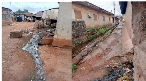
Figure 5. Waste water from residence flowing on to the street at Ikirike and Onu-Asato.