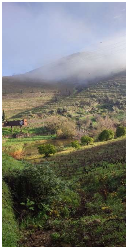
Figure 3. Image of the Douro wine region classified as world heritage by UNESCO.

It is on the agricultural slopes of the Douro valley that the predominance of vineyards is overwhelming. However, at higher elevations, places that we can now classify as the “sub-plateau Douro”, on steeper slopes, there is forestry and sub-Atlantic bush occupation in discontinuous portions, which at certain times of the year stand out for their strong colour. In May, the yellow tufts of the broom stand out between the valley bottoms, typically Mediterranean in appearance, and the plateau region ( Figure 3 ).