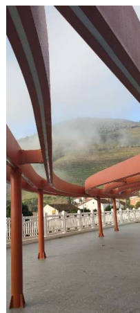
Figure 2. “Pinhão” Village—The Douro Wine Region.

It is important here to focus on the issue of regional tourist use and the development of the municipality of Torre de Moncorvo. It can be said that there are multiple advantages resulting from the tourist use of this type of area. Among them, it should be highlighted the possibility of promoting the wine region with a consequent possible increase in sales volume; new business opportunities linked to tourism emergence; settling population in low-density areas; and preserving and valuing traditions linked to vineyard cultivation and wine production. In fact, the National Strategic Plan for Tourism (PENT) highlights the topic of gastronomy and wine as particularly important for the strategic axis of a territory, destinations, and products 3 . The territories and destinations result from the fact that wine tourism units, spread across a large part of the national territory 4 , are mostly linked to wine routes and inserted in demarcated regions. According to PENT, gastronomy and wine are one of the ten strategic tourism products to be developed and will have a high contribution to the value proposition of the destination Portugal (Figure 2).