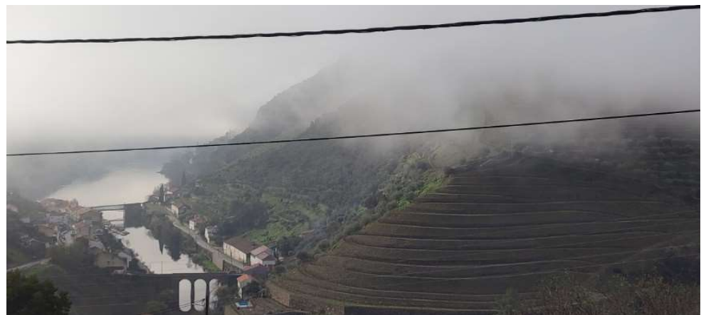
Figure 4. Image of the Douro wine region classified as world heritage by UNESCO “Pinhão” village (Credits by the author).

To the south and southeast extends the extensive plateau area where fruit crops, in this case, almond trees, prevail, although in the foreground they coexist with vineyards. Few spaces are not occupied by some of these two crops. Small patches of arboreal vegetation with darker foliage, corresponding mainly to maritime pines ( Pinus Pinaster Aiton ) and more rarely to small oak chestnuts ( Quercus Robur L. ), appear amidst a lighter green, corresponding to orchards and vines ( Figure 4 ).