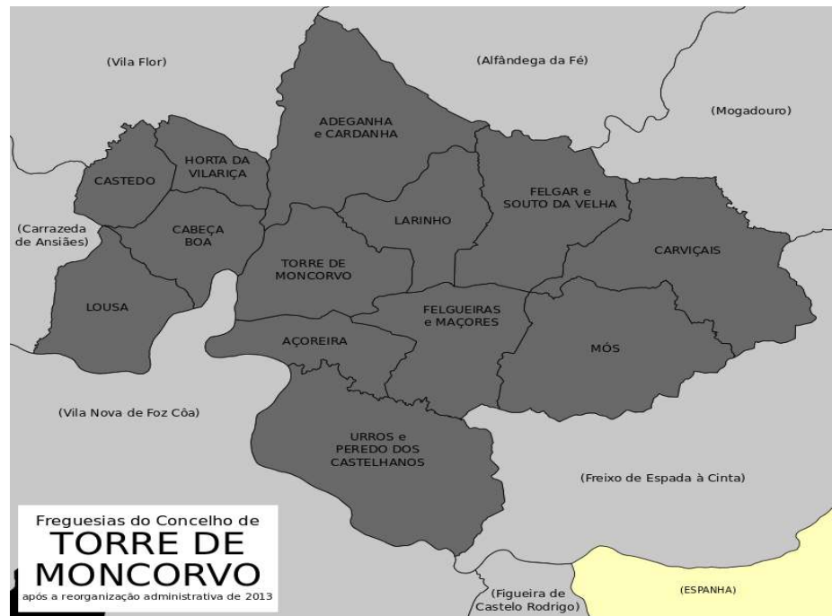
Figure 1. Torre de Moncorvo municipality.

It is important here to focus on the issue of regional tourist use and the development of the municipality of Torre de Moncorvo. It can be said that there are multiple advantages resulting from the tourist use of this type of area. Among them, it should be highlighted the possibility of promoting the wine region with a consequent possible increase in sales volume; new business opportunities linked to tourism emergence; settling population in low-density areas; and preserving and valuing traditions linked to vineyard cultivation and wine production. In fact, the National Strategic Plan for Tourism (PENT) highlights the topic of gastronomy and wine as particularly important for the strategic axis of a territory, destinations, and products 3 . The territories and destinations result from the fact that wine tourism units, spread across a large part of the national territory 4 , are mostly linked to wine routes and inserted in demarcated regions. According to PENT, gastronomy and wine are one of the ten strategic tourism products to be developed and will have a high contribution to the value proposition of the destination Portugal (Figure 2).